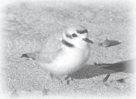
Snowy Plover: Cary Smyle

The simple things you do every day, from the cup of coffee you drink in the morning to the lights you turn on at night, all have an impact on birds. As we human beings expand our presence on the earth, our lives intersect more and more with the wildlife around us. Our everyday activities increasingly erode their habitats, deplete their food supplies, and create new dangers for them to face. If we want to protect the birds around us and preserve their future, we need to begin to conduct our lives with a consciousness of how our actions affect the world around us; not only the people, but the wildlife, the air, the water, and the land.