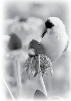
American Goldfinch

10 Plan your yard for diversity. Instead of a “green desert” of lawn of no benefit to wildlife, plant a mixture of native grasses, flowers, and shrubs. Use native species—birds like these best and they are best adapted to where you live. Your state or local Native Plant Society can help you choose species that will work best for you. When your wildlife garden is complete, you can have your yard certified by the National Wildlife Federation. You can also encourage your children to have their schoolyard certified! Visit www.nwf.org .